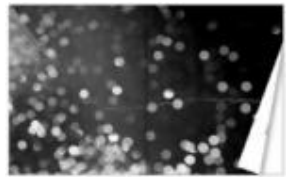
Kathryn Harrison Blue-Stained Walls, 2018, 2018 Bound book of inkjet prints 10 5/8 x 8 1/2 inches 27 x 21.6 cm