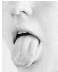
Jennifer Calivas Mouth #1 , 2018 Archival inkjet print on paper 28 3/4 x 23 inches 73 x 58.4 cm Edition 1 of 5, 2 AP