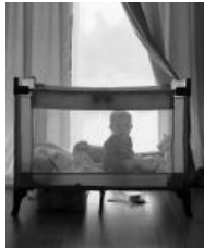
Kathryn Harrison Untitled, Sarasota, Florida 2018, 2018 Archival pigment print Print: 20 x 16 inches 50.8 x 40.6 cm Framed: 20 1/4 x 16 1/4 x 1 1/4 inches 51.4 x 41.3 x 3.2 cm Edition 1 of 5, 1 AP