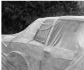
Kathryn Harrison Untitled, Sarasota, Florida, 2017, 2017 Archival pigment print Print: 20 x 24 inches 50.8 x 61 cm Framed: 20 1/4 x 24 1/4 x 1 1/4 inches 51.4 x 61.6 x 3.2 cm Edition 1 of 5, 1 AP