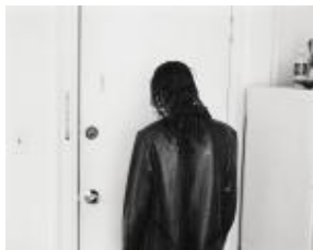
Lacey Lennon Untitled , 2016 Archival pigment print Print: 23 x 29 inches 58.4 x 73.7 cm Framed: 23 1/4 x 29 1/4 x 1 1/4 inches 59.1 x 74.3 x 3.2 cm Edition 3 of 5, 2 AP