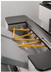
Dan Swindel Pencils , 2018 Pigment print Print: 28 x 20 inches 71.1 x 50.8 cm Framed: 28 3/4 x 20 3/4 x 1 1/2 inches 73 x 52.7 x 3.8 cm Edition 1 of 5, 2 AP