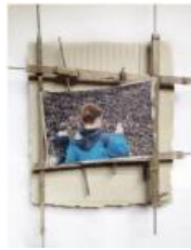
Luke Libera Moore Untitled (Demos) , 2018 Concrete, wood, metal, latex, and toner suspended in acrylic polymer 23 1/4 x 14 3/4 x 3 inches 59.1 x 37.5 x 7.6 cm