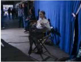
Penn Chan Untitled, 2018 Inkjet print on paper Framed: 31 x 41 x 2 1/8 inches 78.7 x 104.1 x 5.4 cm Edition 1 of 3, 2 AP