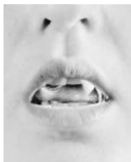
Jennifer Calivas Mouth #11 , 2018 Archival inkjet print on paper 28 3/4 x 23 inches 73 x 58.4 cm Edition 1 of 5, 2 AP