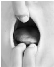
Jennifer Calivas Mouth #12 , 2018 Archival inkjet print on paper 28 3/4 x 23 inches 73 x 58.4 cm Edition 1 of 5, 2 AP