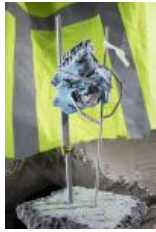
Luke Libera Moore Entropic Totem #7 (Trash Hoist) , 2017 Archival pigment print in artist's frame 18 1/4 x 12 x 4 1/2 inches 46.4 x 30.5 x 11.4 cm Edition 1 of 1, 1 AP