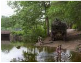
Penn Chan Untitled, 2018 Inkjet print on paper Framed: 31 x 41 x 2 1/8 inches 78.7 x 104.1 x 5.4 cm Edition 2 of 3, 2 AP