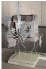
Luke Libera Moore Keeper , 2018 Cardboard, metal, concrete, inkjet print, glass lens, and found objects 29 1/2 x 15 3/4 x 11 inches 74.9 x 40 x 27.9 cm