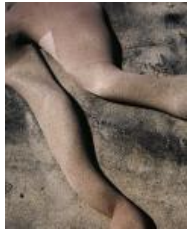
Jennifer Calivas Slough #2 , 2018 Archival inkjet print on paper 37 1/2 x 30 inches 95.3 x 76.2 cm Edition 1 of 5, 2 AP