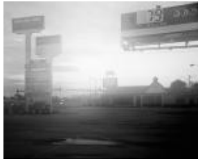
Kathryn Harrison Untitled, Sarasota, Florida 2017, 2017 Archival pigment print Print: 24 x 30 inches 61 x 76.2 cm Framed: 24 1/4 x 30 1/4 x 1 1/4 inches 61.6 x 76.8 x 3.2 cm Edition 1 of 5, 1 AP