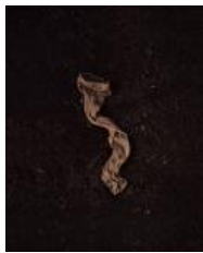
Jennifer Calivas Slough #1 , 2018 Archival inkjet print on paper 20 x 16 inches 50.8 x 40.6 cm Edition 1 of 5, 2 AP