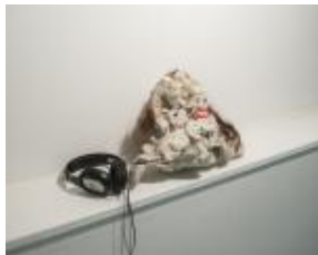
Jennifer Calivas Karen or Whatever #1 , 2018 Papier-mâché, epoxy, polymer clay, wood, metal wire, synthetic hair, headphones, and audio recording 17 x 20 x 12 inches 43.2 x 50.8 x 30.5 cm Edition 1 of 3, 1 AP