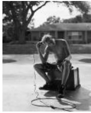
Kathryn Harrison Untitled, Sarasota, Florida 2017, 2017 Archival pigment print Print: 30 x 24 inches 76.2 x 61 cm Framed: 30 1/4 x 24 1/4 x 1 1/4 inches 76.8 x 61.6 x 3.2 cm Edition 1 of 5, 1 AP