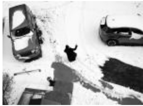
Lacey Lennon Untitled , 2018 Archival pigment print Print: 23 x 31 1/2 inches 58.4 x 80 cm Framed: 23 1/4 x 31 3/4 x 1 1/4 inches 59.1 x 80.6 x 3.2 cm Edition 2 of 5, 2 AP