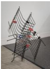
Dan Swindel Organizers , 2018 Pigment print Print: 28 x 20 inches 71.1 x 50.8 cm Framed: 28 3/4 x 20 3/4 x 1 1/2 inches 73 x 52.7 x 3.8 cm Edition 1 of 5, 2 AP