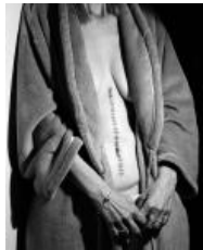
Kathryn Harrison Untitled, Sarasota, Florida 2016, 2016 Archival pigment print Print: 20 x 16 inches 50.8 x 40.6 cm Framed: 20 1/4 x 16 1/4 x 1 1/4 inches 51.4 x 41.3 x 3.2 cm Edition 1 of 5, 1 AP