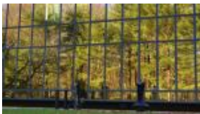
Dan Swindel Mirror , 2017 Single channel video, 2:30 min, color, sound Dimensions vary with installation Edition 1 of 5, 2 AP