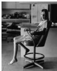
Kathryn Harrison Untitled, Sarasota, Florida 2016, 2016 Archival pigment print Print: 20 x 16 inches 50.8 x 40.6 cm Framed: 20 1/4 x 16 1/4 x 1 1/4 inches 51.4 x 41.3 x 3.2 cm Edition 1 of 5, 1 AP