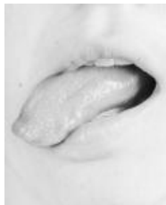
Jennifer Calivas Mouth #6 , 2018 Archival inkjet print on paper 28 3/4 x 23 inches 73 x 58.4 cm Edition 1 of 5, 2 AP