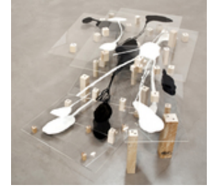
North Gallery Pet Stains and Puddles

Untitled, 1990 Plexiglas, enamel paint, and wood 13 5/8 x 93 x 72 inches 34.6 x 236.2 x 182.9 cm Estate of Al Taylor No. AT (3D-1990.21) TAYAL0589