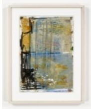
Oscar Murillo Untitled , 2015 Oil and graphite on paper 21 5/8 x 16 5/8 x 1 5/8 inches 54.7 x 42.3 x 4 cm MUROS0605