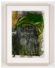
Oscar Murillo Untitled , 2015 Oil and graphite on paper 21 5/8 x 16 5/8 x 1 5/8 inches 54.7 x 42.3 x 4 cm MUROS0601