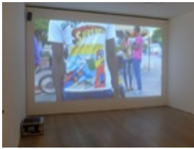
Oscar Murillo meet me! Mr. Superman , 2013-2015 Video projection, 1:16 min (loop), color, sound Edition 1 of 3, 1 AP Certificate of Authenticity MUROS0586