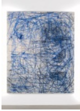
Oscar Murillo catalyst , 2015 Oil, oil stick and dirt on canvas 78 3/4 x 65 x 1 5/8 inches 200 x 165 x 4 cm Signed, titled, and dated verso MUROS0544