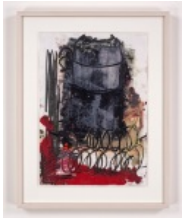
Oscar Murillo Untitled , 2015 Oil and graphite on paper 21 5/8 x 16 5/8 x 1 5/8 inches 54.7 x 42.3 x 4 cm MUROS0602