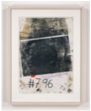
Oscar Murillo Untitled , 2015 Oil and graphite on paper 21 5/8 x 16 5/8 x 1 5/8 inches 54.7 x 42.3 x 4 cm MUROS0600