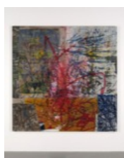
Oscar Murillo 100% vita , 2014-2015 Oil and oil stick on canvas and linen 78 3/4 x 78 3/4 x 1 5/8 inches 200 x 200 x 4 cm Signed, titled, and dated verso MUROS0556