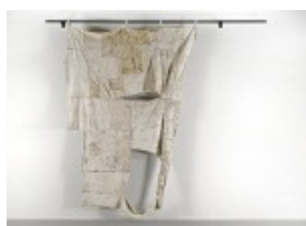
Oscar Murillo day shift , 2015 Oil on canvas and linen Railing and canvas: 141 x 161 x 7 7/8 inches 358 x 409 x 20 cm Canvas: 141 x 87 3/8 inches 358 x 222 cm Signed, titled, and dated verso MUROS0533