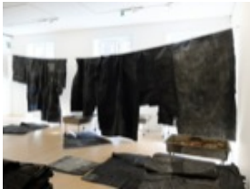
Oscar Murillo meandering - black wall , 2014-2015 Oil, dirt, corn, and clay on canvas and copper wire As installed: 119 3/8 x 387 3/8 x 15 inches 303 x 984 x 38 cm Certificate of Authenticity MUROS0585