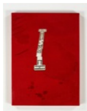
Oscar Murillo binary #1 , 2015 Oil on canvas 15 3/4 x 11 7/8 x 7/8 inches 40 x 30 x 2 cm MUROS0567