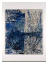
Oscar Murillo catalyst #3 , 2015 Oil, oil stick, and dirt on canvas 78 3/4 x 65 x 1 5/8 inches 200 x 165 x 4 cm Signed, titled, and dated verso MUROS0541