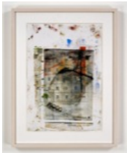
Oscar Murillo Untitled , 2015 Oil and graphite on paper 21 5/8 x 16 5/8 x 1 5/8 inches 54.7 x 42.3 x 4 cm MUROS0603