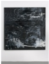
Oscar Murillo lessons in aesthetics and productivity (0) , 2015 Oil and oil stick on canvas 70 7/8 x 70 7/8 x 1 5/8 inches 180 x 180 x 4 cm Signed and titled verso MUROS0610