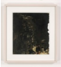
Oscar Murillo Untitled , 2015 Oil on paper 17 5/8 x 16 3/8 x 1 5/8 inches 44.6 x 41.6 x 4 cm MUROS0596