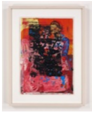
Oscar Murillo Untitled , 2015 Oil and graphite on paper 21 5/8 x 16 5/8 x 1 5/8 inches 54.7 x 42.3 x 4 cm MUROS0604