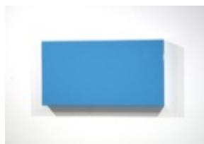
John McCracken Vista , 2004 Polyester resin, fiberglass, and plywood 15 x 28 x 3 1/2 inches 38.1 x 71.1 x 8.9 cm Signed, titled, and dated verso MCCJO0144

2nd Floor; Main Gallery (left to right from gallery entrance)