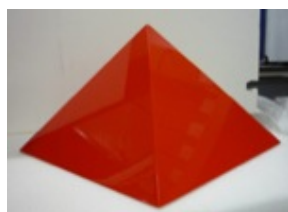
John McCracken Red Pyramid , 1975 Polyester resin, fiberglass, and plywood 10 x 16 x 16 inches 25.4 x 40.6 x 40.6 cm Signed and dated on base Collection Orange County Museum of Art, Newport Beach, CA; Gift of Mr. and Mrs. M. A. Gribin MCCJO0370