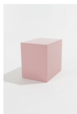
John McCracken Untitled (Pink Block) , 1968 Lacquer, fiberglass, and plywood 11 1/8 x 11 7/8 x 8 3/4 inches 28.3 x 30.2 x 22.2 cm Signed and dated on base Private Collection MCCJO0441