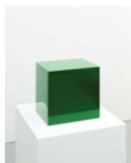
John McCracken Green Block , 1969 Polyester resin, fiberglass, and plywood 7 x 7 1/2 x 6 inches 17.8 x 19.1 x 15.2 cm Signed and dated on base Private Collection MCCJO0094A