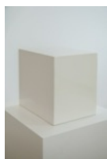
John McCracken John , 1967 Polyester resin, fiberglass, and plywood 8 1/2 x 9 x 6 3/4 inches 21.6 x 22.9 x 17.1 cm Signed and dated on metal plate on base MCCJO0556