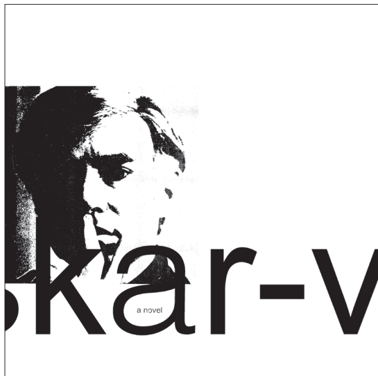
Artist book Oskar , 2014