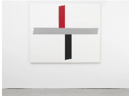
Alan Uglow T-3 , 2010 Acrylic on cotton 59 7/8 x 72 inches 152 x 183 cm Signed and dated verso UGLAL0213