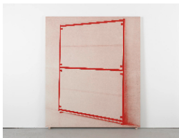
Alan Uglow Portrait of a Standard (Red) , 2000 Screenprint on canvas 84 1/4 x 72 inches 214 x 183 cm UGLAL0229