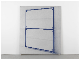
Alan Uglow Portrait of a Standard (Blue) , 2000 Silkscreen on canvas 84 x 72 x 1 1/2 inches 213.4 x 183 x 3.8 cm UGLAL0201