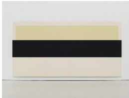
Alan Uglow Green / Black / Off-White , 1991 Acrylic on fiberglass 48 7/8 x 96 inches 124 x 243.8 cm Signed verso UGLAL0228