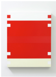
Alan Uglow Untitled , 2006 Acrylic on cotton 22 1/8 x 18 x 1 3/8 inches 56.2 x 45.7 x 3.5 cm Signed and dated verso UGLAL0207