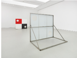
Alan Uglow Torwand (Red) / Torwand (Blue) , 2004 Acrylic on aluminum 2 parts, each: 71 3/4 x 78 3/4 x 48 1/8 inches 182.2 x 200 x 122.2 cm UGLAL0205