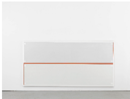
Alan Uglow Equator #3 , 2003 Acrylic on cotton 48 x 84 1/4 inches 121.9 x 214 cm Signed and dated verso UGLAL0204