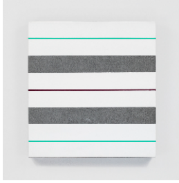
Alan Uglow (Wraparound) , 1993 Acrylic on galvanized metal 16 1/2 x 15 x 1 1/8 inches 41.9 x 38.1 x 2.9 cm Signed verso UGLAL0190