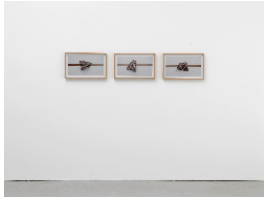
Alan Uglow Moth 1-3 , 2009 Chromogenic print 3 photographs Each, framed: 13 5/8 x 21 5/8 inches 34.5 x 55 cm Paper: 10 1/2 x 18 1/2 inches 26.7 x 47 cm UGLAL0253